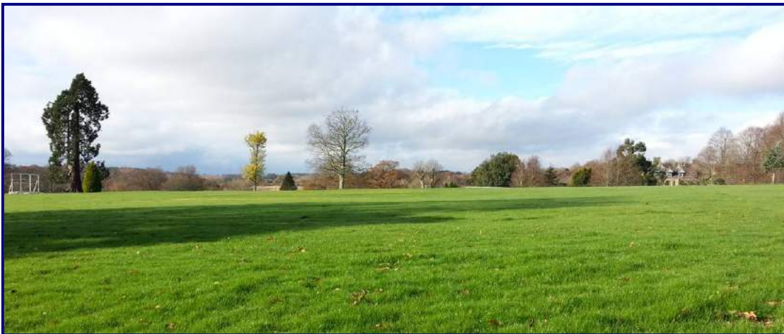
Views from highway across Cuckfield Cricket Ground toward the Elizabethan house and the Adur valley beyond